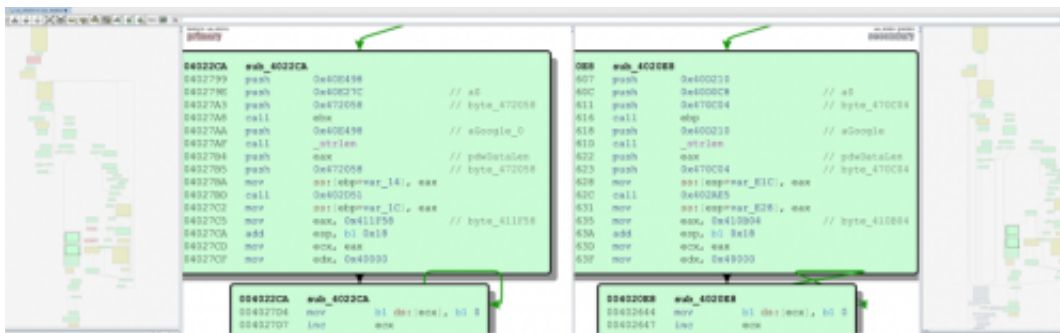
Figure 5. Comparing code blocks responsible for URL creation

012fe5fa86340a90055f7ab71e1e9989db8e7bb7594cd9c8c737c3a6231bc8cc